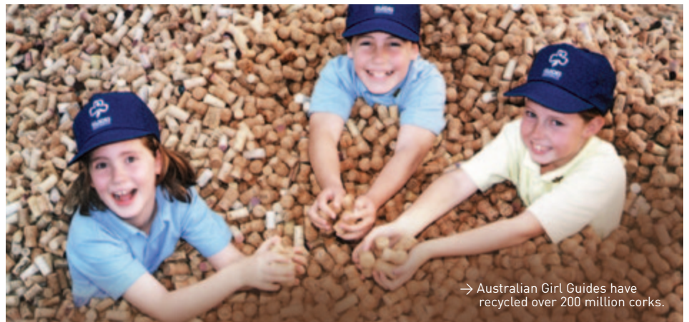
→ Australian Girl Guides have recycled over 200 million corks.