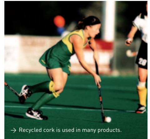
→ Recycled cork is used in many products.

“These programs are positive on so many levels — they are good for the environment, they are important fundraising activities for voluntary organisations and they help to communicate important messages about sustainability.”