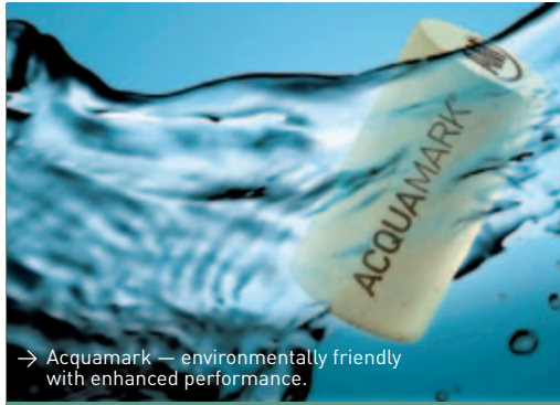
→ Acquamark — environmentally friendly with enhanced performance.